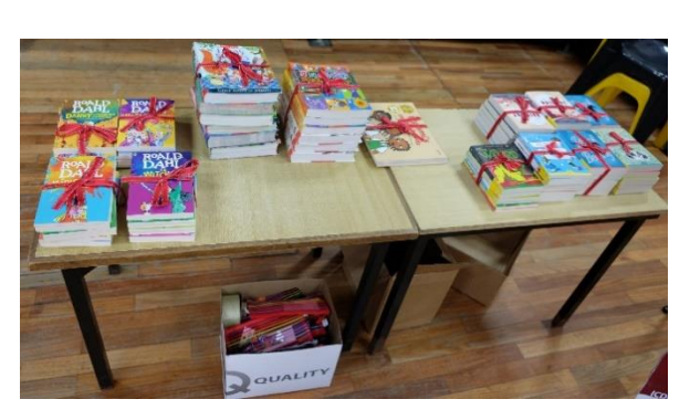
Some of the book prizes on offer at the Phendulani Literary Quiz in Makhanda.