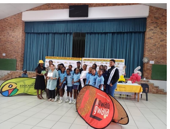
The winning team from Thekwane