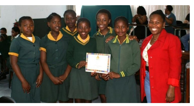
Second place was tied between Ithuba Wild Coast Community College (above) and Insingizi Primary School (right)