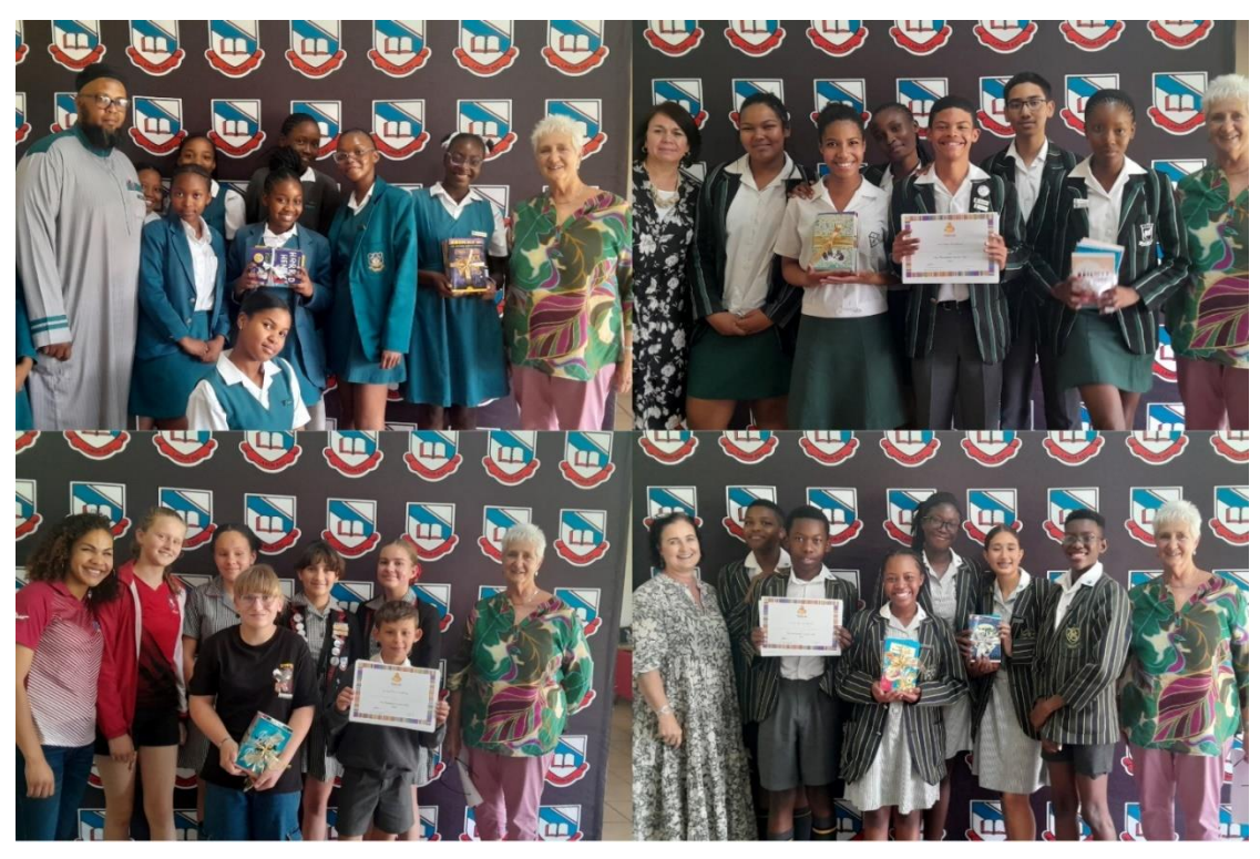
Enthusiastic teams from Kimberley's first Phendulani Quiz

Learners today do not have adequate exposure to reading or books, as a result of economic conditions but also the changing nature of how children are being raised. Learners are prone to choosing electronic devices over paperback books, or programs on their computers over graphic novels and animated films over story books. But it is our responsibility as educators to foster a love of literature within them.