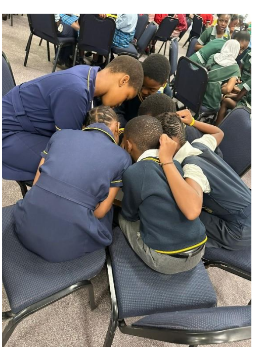
A team discussing the answer

Each participating school won a gift box filled with a selection of new books for their library and the top four schools won extra books for their libraries.